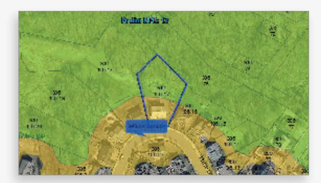
Preliminary Map Search